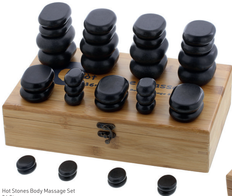
Hot Stones Body Massage Set 36 Stones Includes: - 8 x Large - 14 x Medium - 6 x Small - 8 x Toes 6725