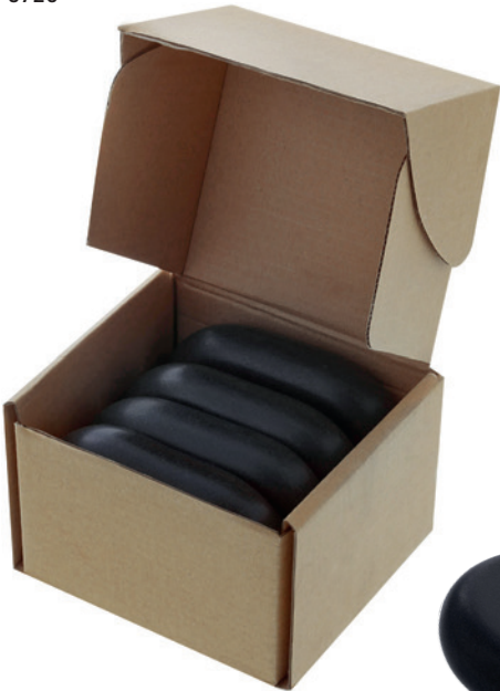
X-Large Oval, 4 pieces 6720