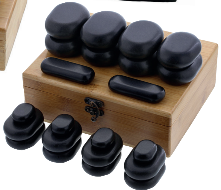
Hot Stones Mini Body Massage Set 22 Stones Includes: - 8 x Large - 8 x Medium - 4 x Small - 2 x Mini 6724