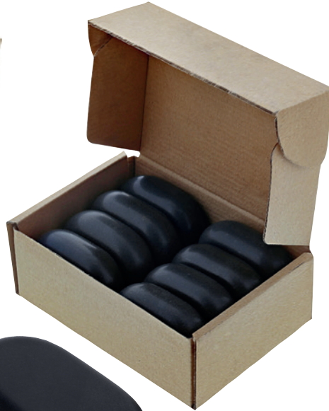
Large Oval, 8 pieces 6721